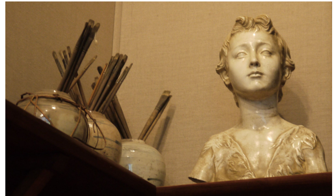
In the studio

The Otto Ubbelohde Foundation is established.