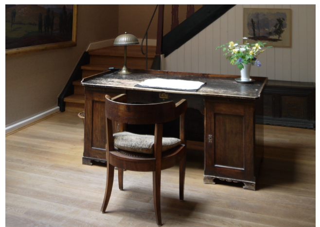
The artist's desk where the illustrations to the Grimms' fairytales were designed.